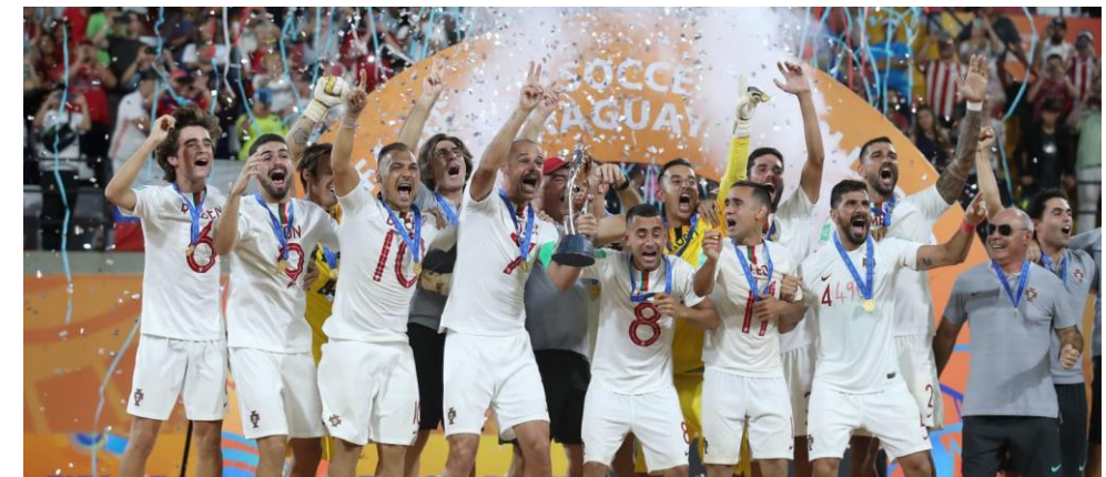
PORTUGAL IS FIFA BEACH SOCCER WORLD CHAMPION 2019

In 2019, the event in the Beach Soccer galaxy is the FIFA Beach Soccer World Cup in Paraguay. By organizing International Beach Soccer Cup Indonésia, you can stand out and offer an offbeat approach to football ... New energy for all football lovers.